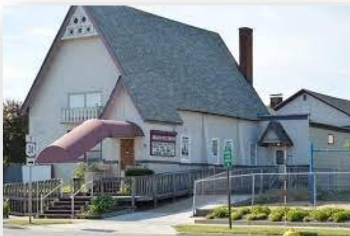
Holland Civic Theatre

Many thanks go to affiliate CTAM member -- The Lebowsky Center -- for their willingness and dedication in offering to host this bi-annual event again. They have hosted before and they have the perfect set-up for the competition. The hotel is within one block of the performance space, as well as a corps of experienced volunteers, anxious to welcome us to their building.