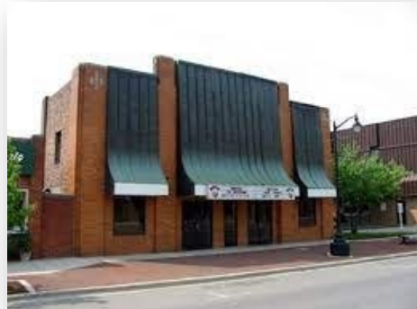
The Sauk Theatre, Jonesville

HELPING COMMUNITY THEATRE THRIVE IN MICHIGAN SINCE 1951!