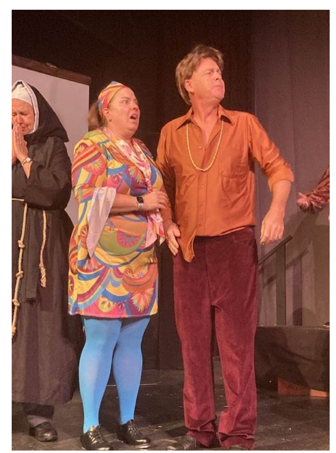
Tawas Bay Players started their current season out with a bang, presenting <u>Disaster</u>, the <u>Musical</u> for everyone's enjoyment. This production, one of the first in Michigan, was written by Seth Rudetsky of Sirius fame!