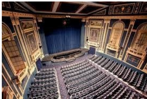
Top, Stagecrafters in Royal Oak; middle is Village Players of Birmingham, and, bottom, St. Dunstan's in Bloomfield Hills. All three theatres are located very close within a mile or so of each other.