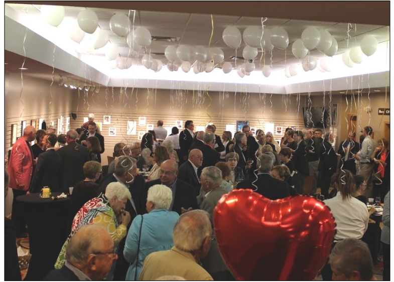
Bay City Players is celebrating their 100th Anniversary this season and they had a fancy Gala for members and audience members. They had 250 guests who celebrated to a fare-thee-well. Congratulations, Bay City Players!