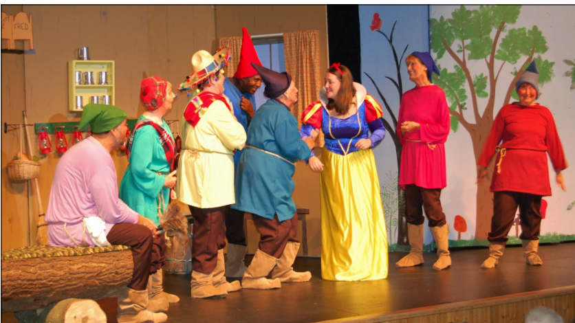
Bottom left, is Snow White and the Seven Dwarfs, presented by Tawas Bay Players. Lower right, he is a very model of a modern Major-General from Grosse Pointe Theatre's Pirates of Penzance in September.