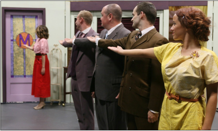
Above, the classic She Loves Me is presented by Riverwalk Theatre in Lansing...just prior to its revival on PBS! Great timing.