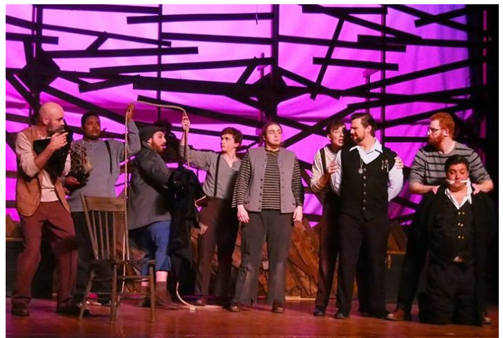
Grosse Pointe Theatre had a good time with Peter and the Stargazer in January.