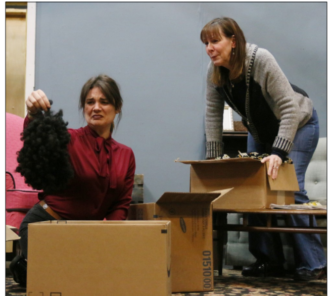
The mind boggles at the significance of the wig in the packing carton in White Buffalo , presented by Riverwalk Theatre in Lansing recently.