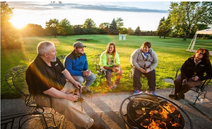
The Saturday night bonfire is always a big hit!

Just so our fashion mavens and divas (plus the rest of us!) know well ahead of time, you will need to bring something RED to wear: shirt, dress, hat, beads...your choice!