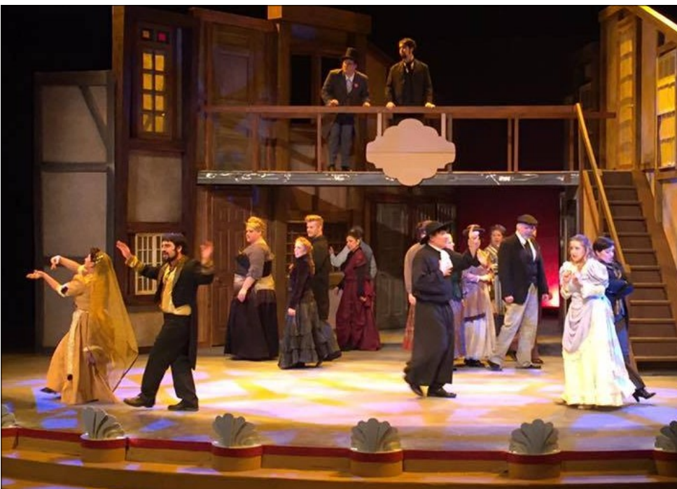
Top, Hello Dolly at Grosse Pointe Theatre in May.