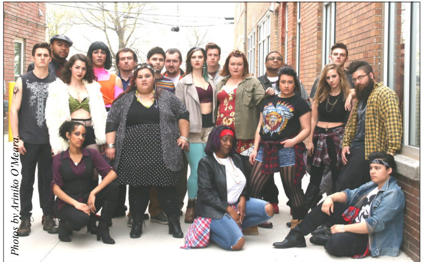
Riverwalk Theatre in Lansing is offering Rent this month to their audiences.

Use the back of mailings to your advantage. A recent survey by a direct marketing firm discloses that three-quarters of people turn their envelopes over to open them, giving you another chance to grab the reader's attention and to tout the offerings inside.