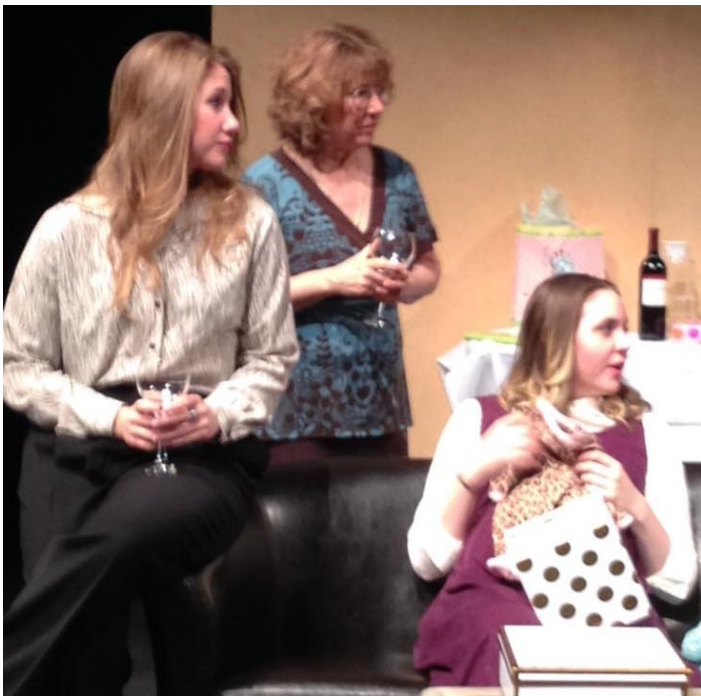
The Heidi Chronicles from Twin City Players.

(Excerpted from American Patchwork & Quilting, June 2016.)