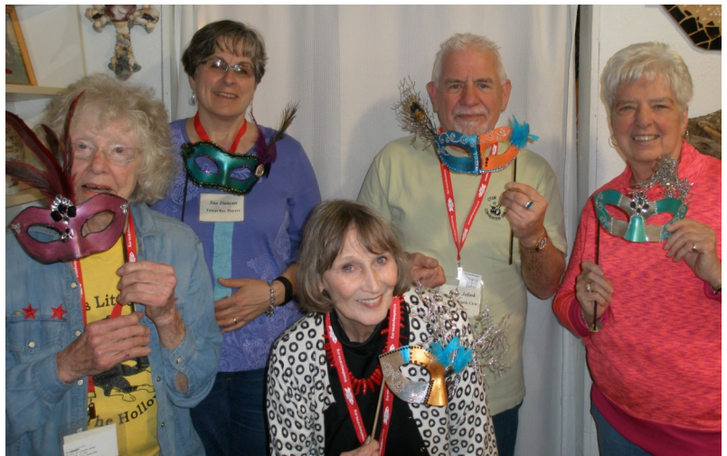
Scenes from the 2016 Spring Conference, hosted by the Tawas Bay Players. A mask-making workshop Friday evening, above, and networking in the lobby between workshops on Saturday morning.