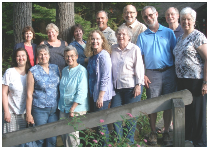
The proud graduates of the 2015 Master Classes!

The Master Class experience is one of CTAM's most valuable membership offerings. Don't miss your opportunity to take advantage of it!