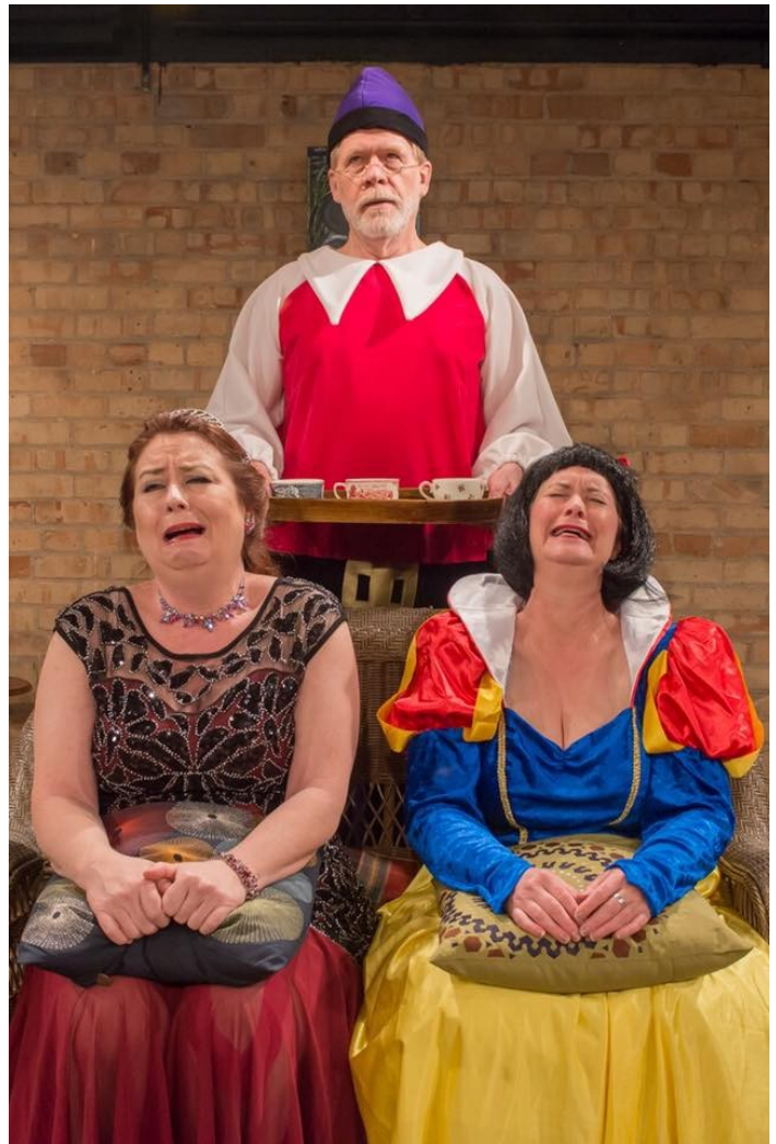
Old Town Playhouse in Traverse City had a good romp with Vanya and Sonia and Masha and Spike