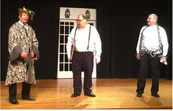
Top photo is <u>The Drowsey Chaperone</u>, presented by Gratiot County Players earlier this season.

CTAM is changing our web address to www.communitytheatremichigan.org Please change your records so that you can easily find us on the internet.