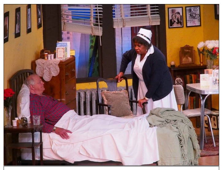
Grosse Pointe Theatre offered <u>The Sunshine Boys</u> to their patrons in November 2016.

Cost for the class is $50 for CTAM individual members and $65 for nonmembers. This is in addition to the AACTFest registration fee. Visit the Bay City Players website to register for AACTFest and this class. CTAM scholarship funds may be used for registration. For further information or to apply for scholarship funds go to <a href="http://communitytheatremichigan.org/index.php/scholarships-2/">http://communitytheatremichigan.org/index.php/scholarships-2/</a>.