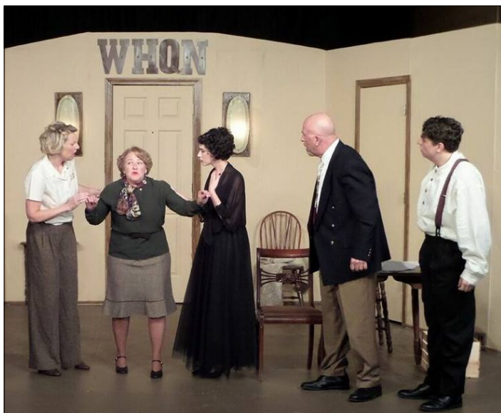
Rosedale Players had a good time with their successful run of It Came from Mars in November.