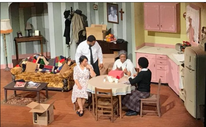
Muskegon Civic Theatre did Raisin in the Sun in January this year, to great reviews!