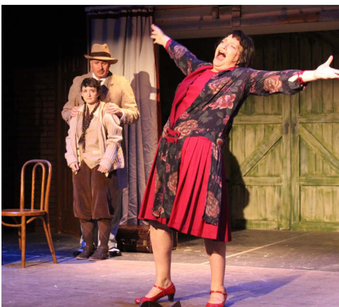
Mama Rose belts it out for St. Dunstan's production of Gypsy!